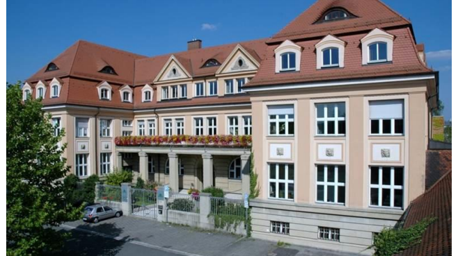
Riedhammer main office in Nuremberg

Riedhammer provides various solutions from revamping up to new turn-key plants based on the most advanced technology and proven reliability. Tradition and experience are conjoining here as best with state of the art development, engineering, construction and commissioning to a new generation of furnaces including all required auxiliary equipment.