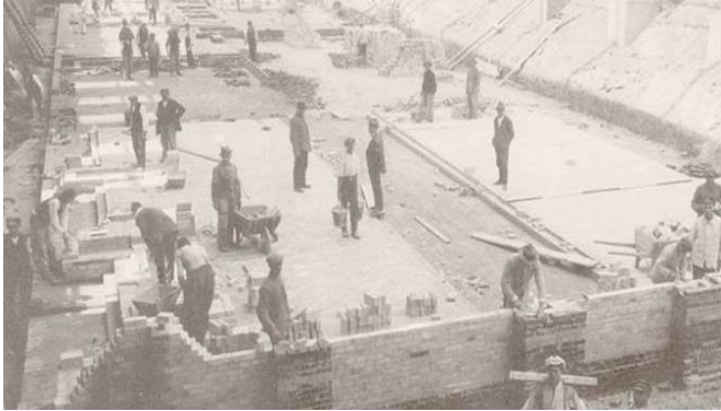
First Riedhammer Baking Furnace