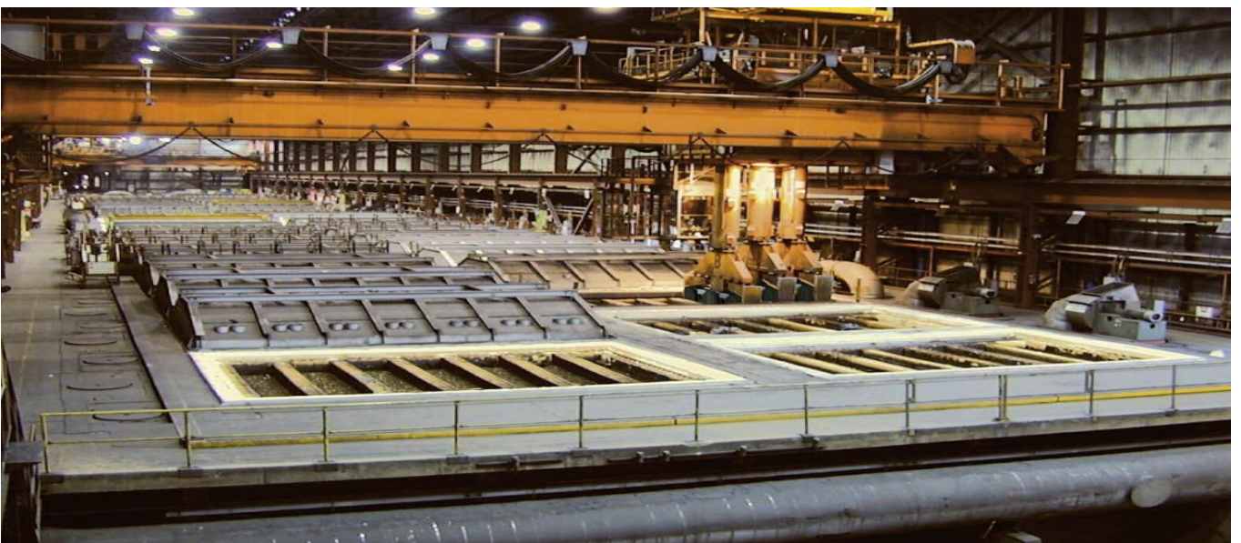
Closed Type Carbon Baking Furnace

Engineers and technicians of the Riedhammer team are trained to optimize projects progresses in the sense of the client. That results in minimized project run-times, minimized costs and maximized return on investment.